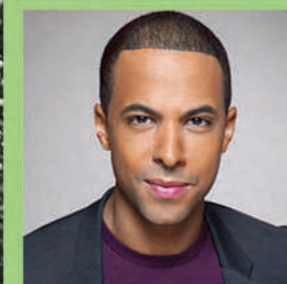
Marvin Humes: Patron, Radio DJ, TV Presenter and former member of JLS. Whilst at D&B as a teen, Marvin also appeared in the West End as well as on TV in Holby City through D&B Management.